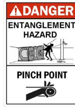
Participant Chosen Intervention