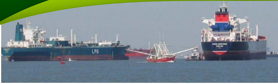
Observation & Community Involvement