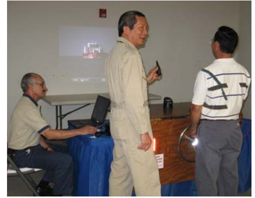
Hands-on Training in Vietnamese